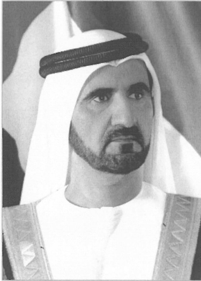
His Highness Sheikh Mohammed Bin Rashed Al Maktoum

Vice President and Prime Minister of the United Arab Emirates, Ruler of Dubai