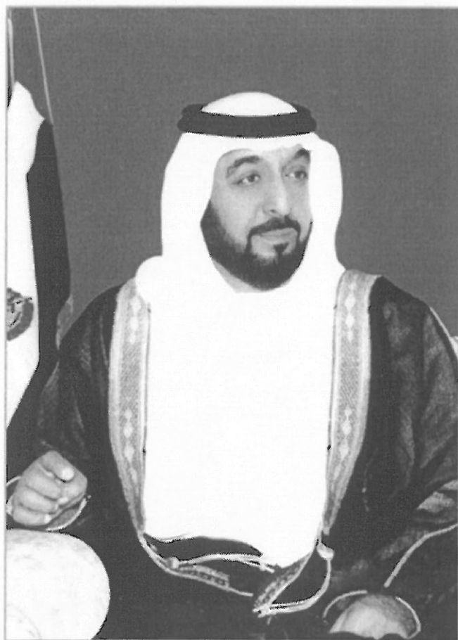
His Highness Khalifa Bin Zayed Al Nahyan